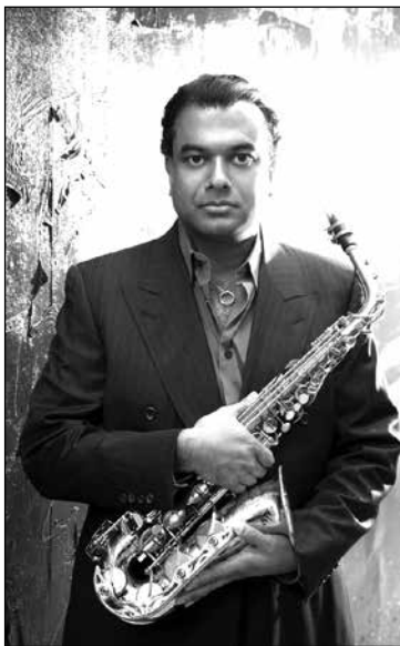
Rudresh Mahanthappa is the new director of Princeton University's jazz studies program.

Commenting to Jersey Jazz on his brief tenure as Director